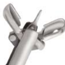
Serrated Oval Cups