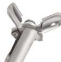
Serrated Oval Cups with Spike