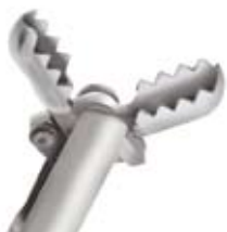
Oval Cups with Spike